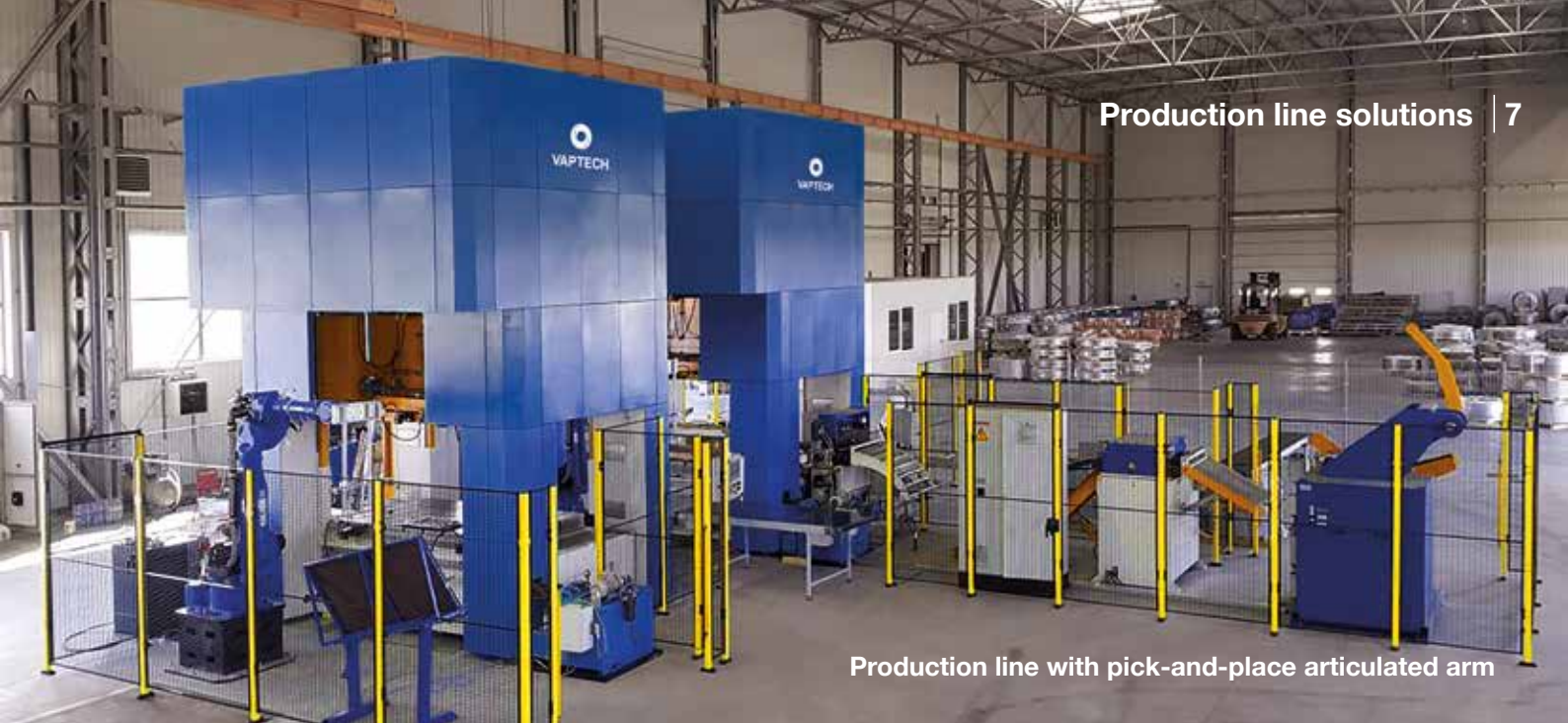
Production line with pick-and-place articulated arm